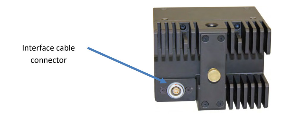
Figure 1 - InfraRed Short-Range connector

Connect the InfraRed Short-Range cable into the rear connector, as seen in the following picture.