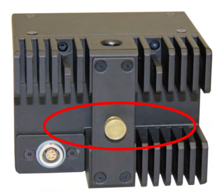
Figure 3 - Mounting screw