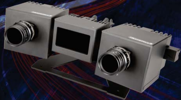
Remote tabletop setup with slave tracker